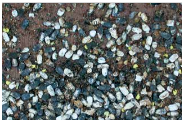
Mummies on the hive floor

Honey bee stocks differ in susceptibility to chalkbrood disease, so beekeepers should replace the infected colony's queen bee with one supplied by a reputable breeder. This variation in susceptibility is mainly due to differences in the hygienic ability of the honey bees to uncap and remove diseased brood. By selecting queen bees or obtaining honey bees from hives that show this trait, the effects of chalkbrood disease can be reduced.