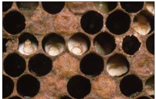
Dead larvae in cells that have turned white due to fungal growth