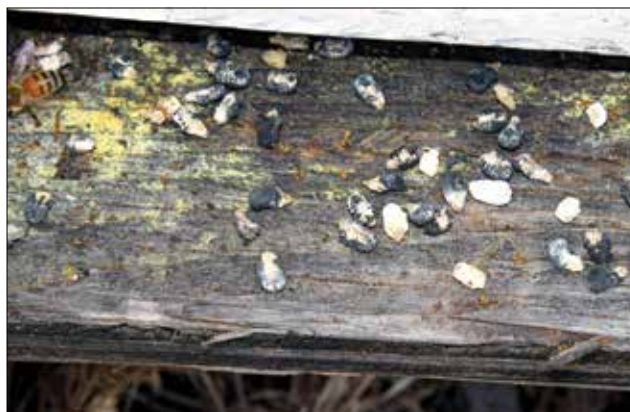
Mummies are moved from the infected cells or hive floor by nurse bees to the hive entrance