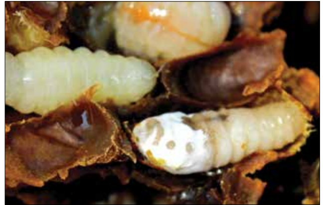
The chalkbrood fungus starting to envelop a developing pupa

Chalkbrood disease symptoms of scattered brood with perforated cappings could be confused with either American foulbrood (AFB), European foulbrood (EFB) or sacbrood virus. However, the presence of mummies in the cells, the hive entrance and bottom boards, together with no rosy thread when conducting the ropiness test, would suggest chalkbrood disease is the cause.