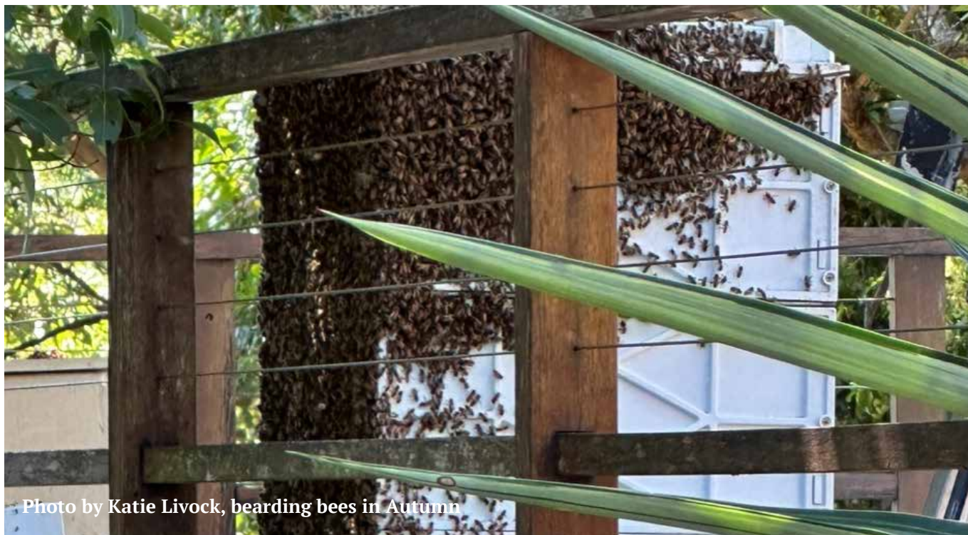
bearding bees in Autumn