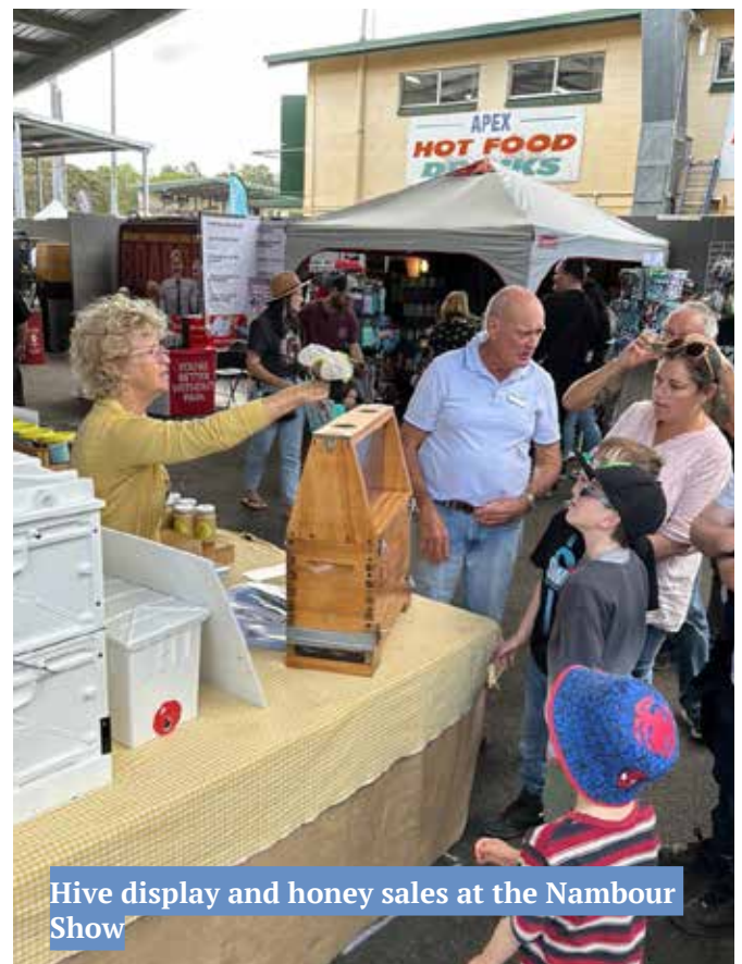
Hive display and honey sales at the Nambour Show