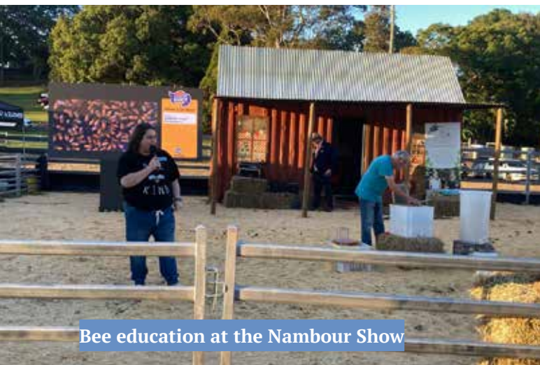
Bee education at the Nambour Show