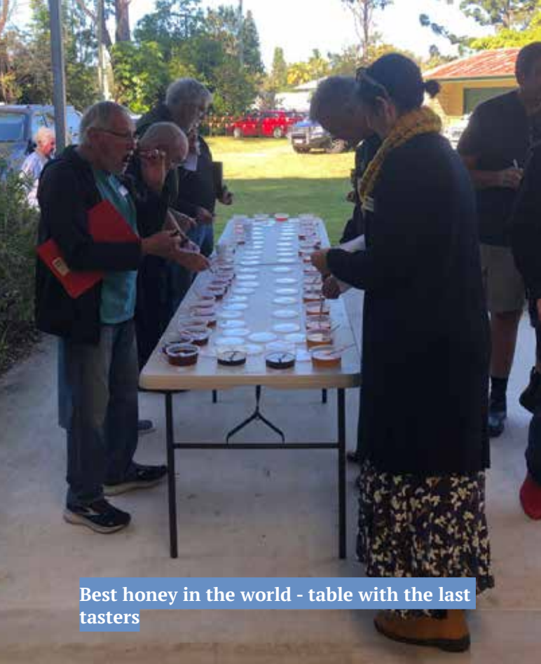
Best honey in the world - table with the last tasters