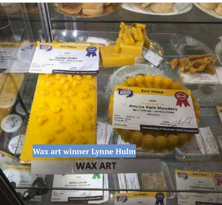
Wax art winner Lynne Hulm