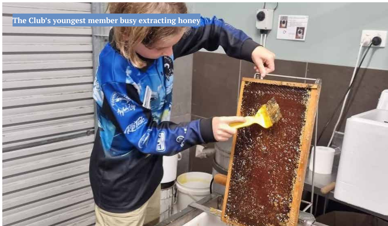
The Club's youngest member busy extracting honey